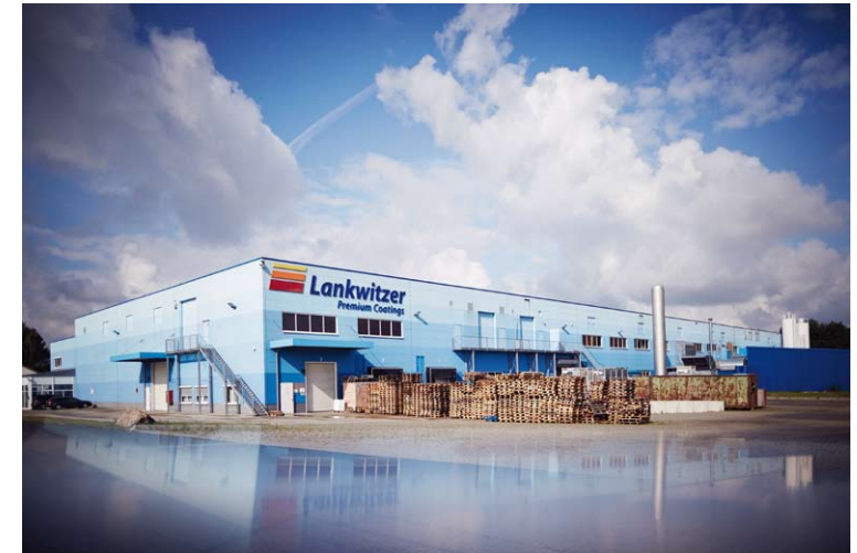
Lankwitzer Lackfabrik GmbH